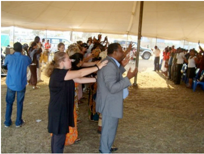
Missionaries Get Behind Mozambican Leaders—It's Time for the Mozambicans to Rise Up!