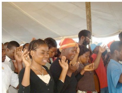
Responding To The Nazirite Call