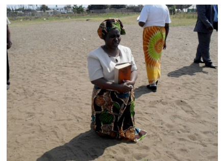
Rosa da Glória (Rose of Glory) from Mozambique House of Prayer—a Moravian-type African Prayer Movement