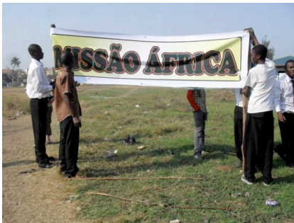
Ushers Re-direct The Army