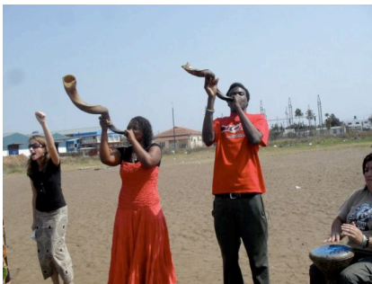
The Battle Cry