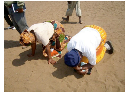
Touching God's Heart