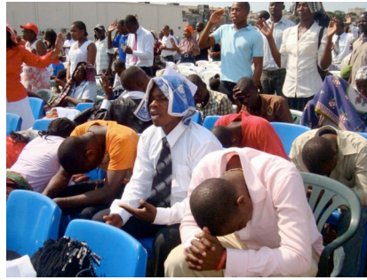
Turning Up The Heat