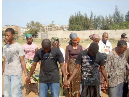
Leaders Repent at Front of the Assembly

I want to end this story by sharing a dream that a Mozambican leader had a couple of days before the solemn assembly. He was in a tall building and a woman was giving birth. Suddenly another tall building, like a twin tower, came and crashed against the one he was in. Everything shook, but the other one fell while the one he was in was left standing.