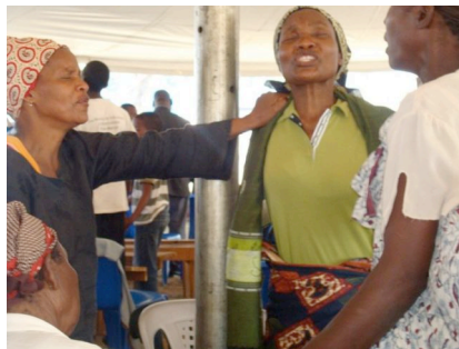
Brokenness In The Tent